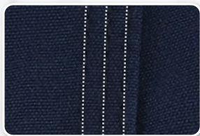
Triple-Needle Felled Seams for Increased Durability