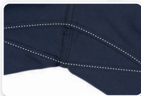
Diamond Crotch Gusset for Enhanced Mobility